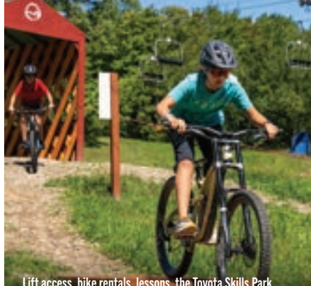
Lift access, bike rentals, lessons, the Toyota Skills Park and views of the valley - find it all at Okemo Bike Park.